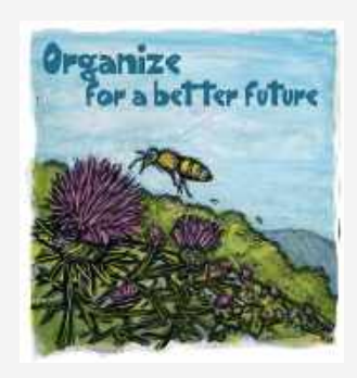
ICEJ meets Sept. 10 @ 3:30 p.m. Join us!